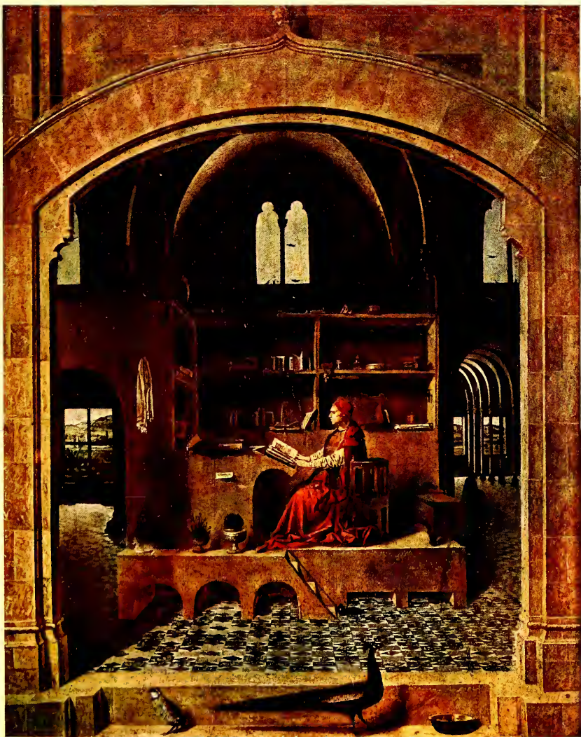
ST. JEROME IN HIS STUDY.

From the picture by Antonello da Messina, in the National Gallery, London.